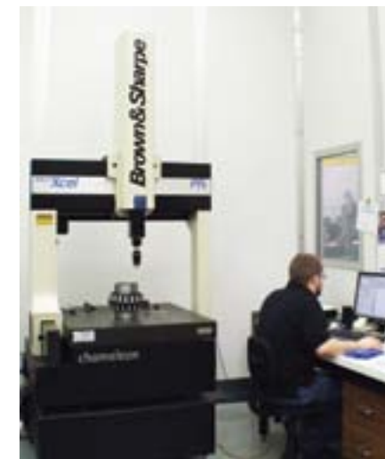
CMM Dimensional Testing